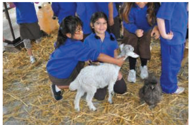
Prep classes have a visit from Old McDonald