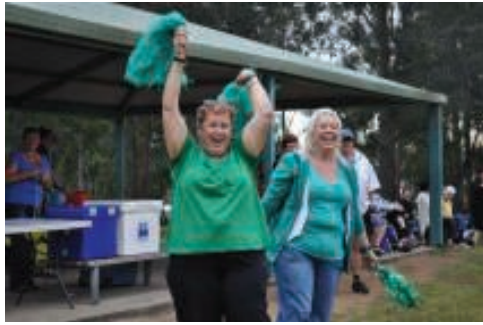
Cheering at sports day