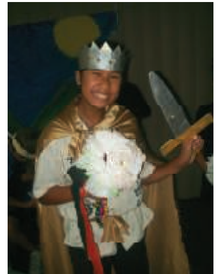
Prince Charming in the class play...