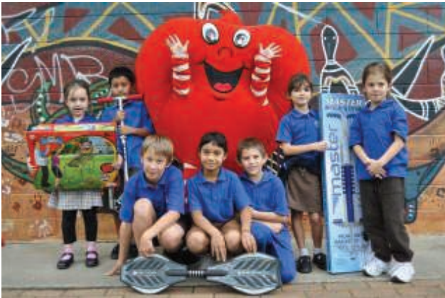
Happy Heart and the Jump Rope Program