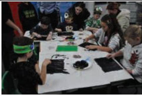
Helping at the Year 1 Space Invaders evening