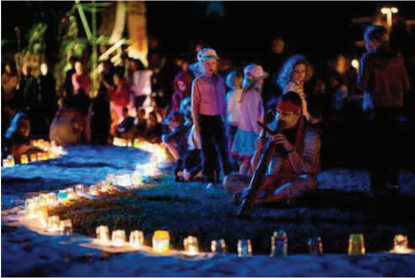
A visit to KITE Theatre at QPAC and the magical 'Sand Song' ritual...