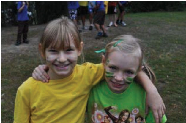
Sports day fun