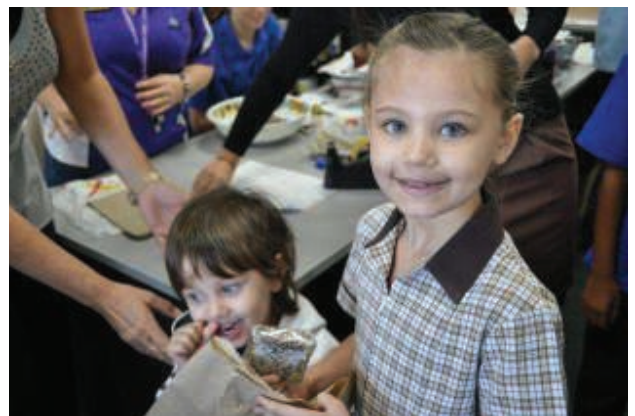
Thinking of Mum at the SEP Mother's Day Stall