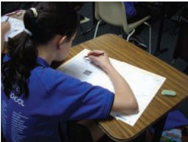
Studying hard for NAPLAN...