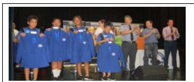
Vice School Captains