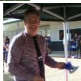
CONGRATULATION TO JIRAH OF YEAR 2