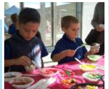
FOR GUESSING HOW MANY LOLLIES IN THE JAR AT UNDER 8'S DAY